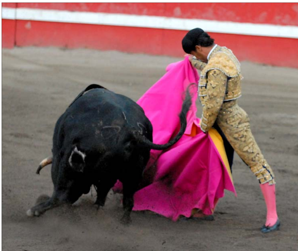
Carregando la suerte